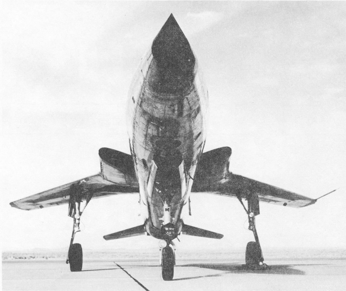
THE SLEEK F-105 THUNDERCHIEF Makes an imposing silhouette in its supersonic configuration. The Republic-built tactical fighter-bomber is capable of fly-at classified Mach-plus speeds and is heavily armed with nuclear capability.